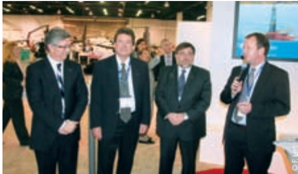
Eurocopter CEO Lutz Bertling attended the ceremony held at Heli-Expo 2009 to celebrate the contract signed by Eurocopter and Canadian Helicopters.

With a fleet of more than 130 helicopters, Canadian Helicopters is currently the largest operator in Canada. The lion's share of its activities focuses on three areas: IFR flights (EMS, oil and gas, infrastructure maintenance), aerial work in VFR, and aircraft maintenance/pilot training (from ab initio to advanced training).